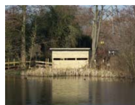
The new Friends Bird Hide taken from Ant Island

The work on the actual hide started in January this year and has been a very rewarding project. We feel it will prove to be a great asset to the centre.