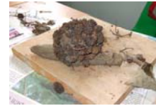
Snail made during Mini Buzz Club