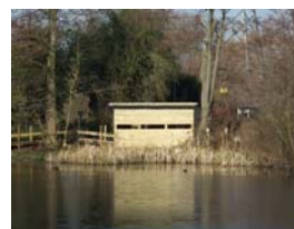
The new Friends Bird Hide taken from Ant Island

The work on the actual hide started in January this year and has been a very rewarding project. We feel it will prove to be a great asset to the centre.