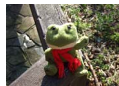
Clyde Frog, as part of the new activity trail