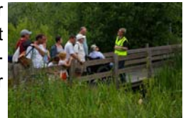
A guided tour of the Nature Reserve on the 2007 Open Day

Please see our events leaflet or call the centre for further information.